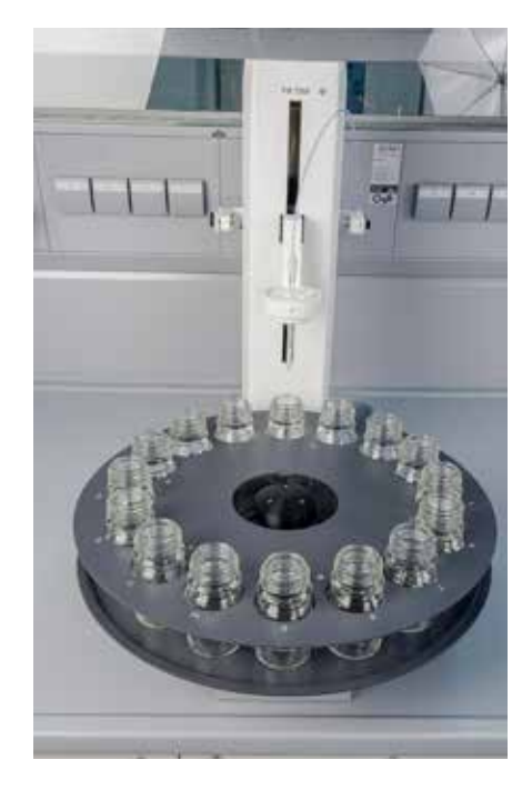
TW 7200 with TZ 4058 for VZ 7081 100 ml laboratory bottles

As an alternative to volumetric flasks and very accurate weighing, the TITRONIC® 500 piston burette (with WA 50V exchange unit for highly aggressive and viscous solutions) together with the TW 7200 sample changer can be used for further automation and simplification.