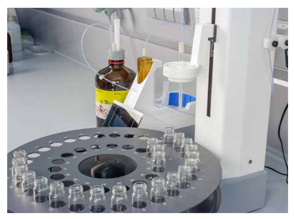
TZ 4050 sample tray for VZ 7088 laboratory bottles