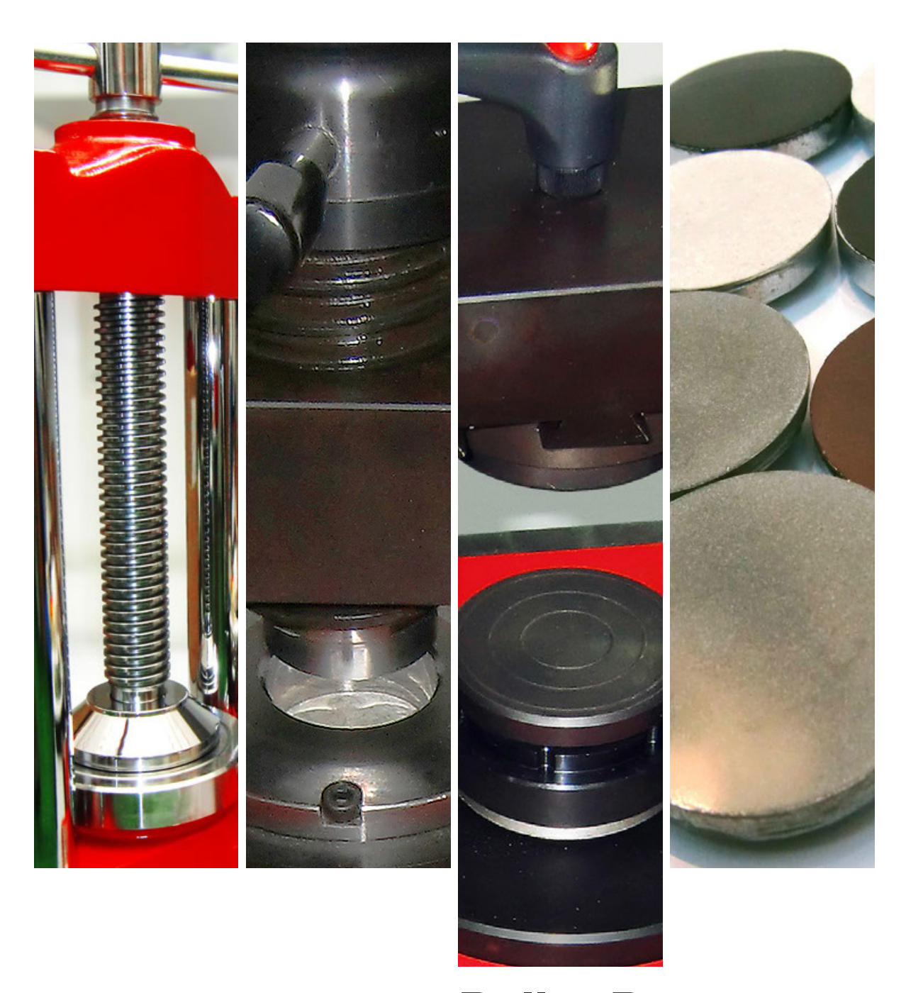
Pellet Press Series