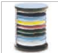
Storage rack for your consumables