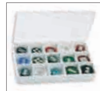
Specimen storage box